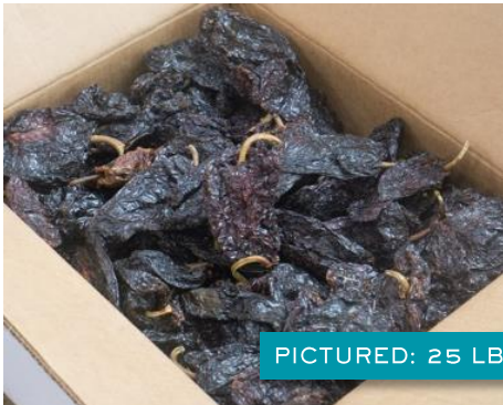
PICTURED: 25 LB