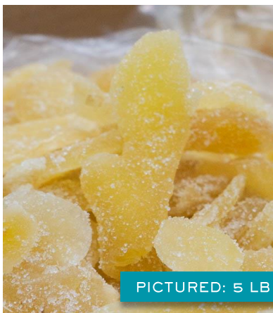
PICTURED: 5 LB