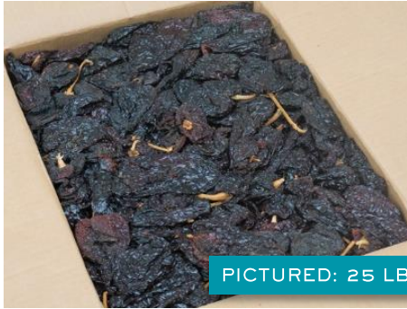
PICTURED: 25 LB