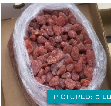
PICTURED: 5 LB