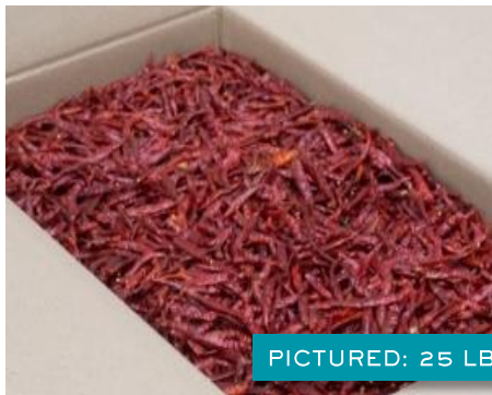
PICTURED: 25 LB