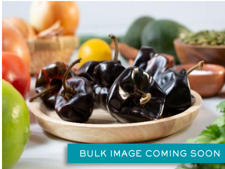
BULK IMAGE COMING SOON