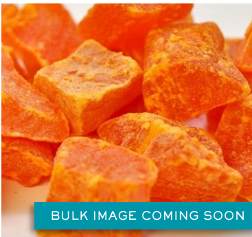
BULK IMAGE COMING SOON