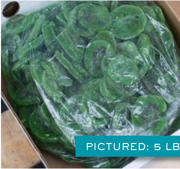
PICTURED: 5 LB