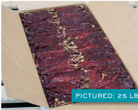
PICTURED: 25 LB