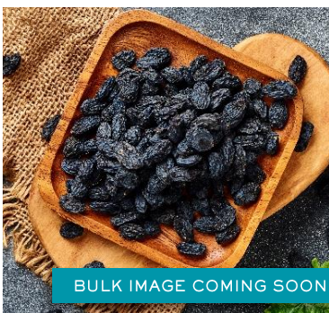
BULK IMAGE COMING SOON