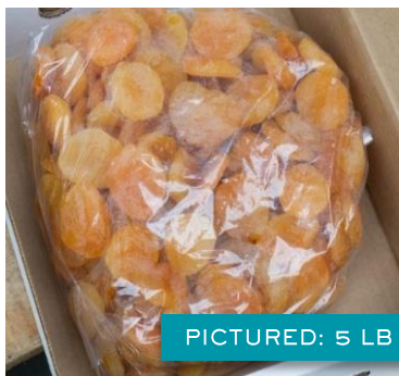
PICTURED: 5 LB