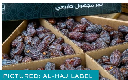
PICTURED: AL-HAJ LABEL