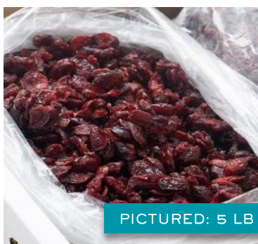
PICTURED: 5 LB