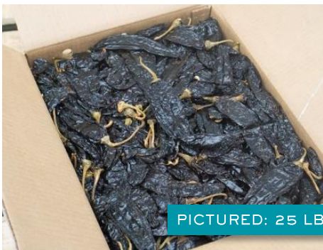
PICTURED: 25 LB