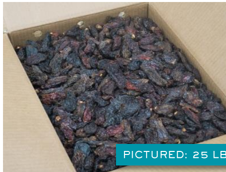
PICTURED: 25 LB